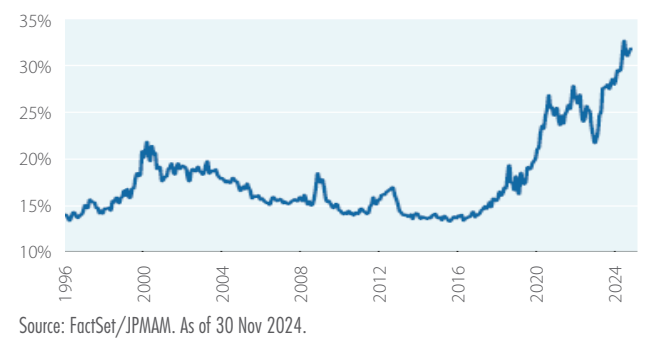
Exhibit 1: Market Capitalization of Largest 7 Companies in S&P 500<sup>®</sup> Index

So, we know that overall, the non-Magnificent Seven share prices have lagged terribly over the past several years. But how have these companies done from an earnings, rather than a stock market, perspective? Exhibit 2 shows earnings growth of the Magnificent Seven from 2019 through 2023. (2024 numbers are not yet available.)